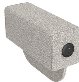
Model No. 82334BGE17