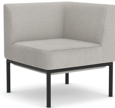
Corner Seat: 82332 + Metal Base: 82330 Kit No. CHK82332BLKBGE17