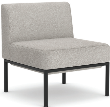
Single Seat: 82331 + Metal Base: 82330 Kit No. CHK82331BLKBGE17