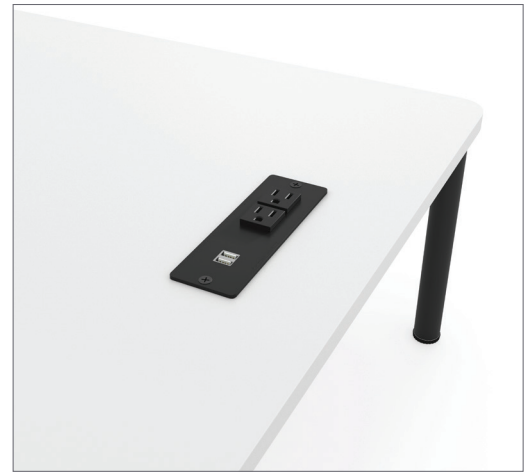
Built in Power Module