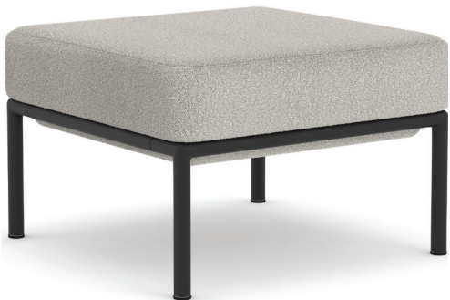
Ottoman: 82333 + Metal Base: 82330 Kit No. CHK82333BLKBGE17